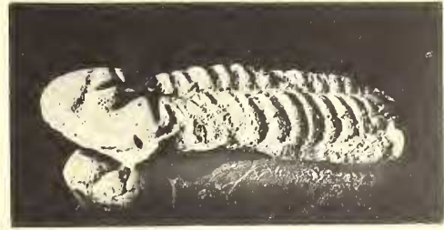
11 x 2.5